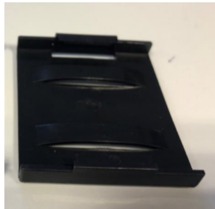
First Supplier (no changes)